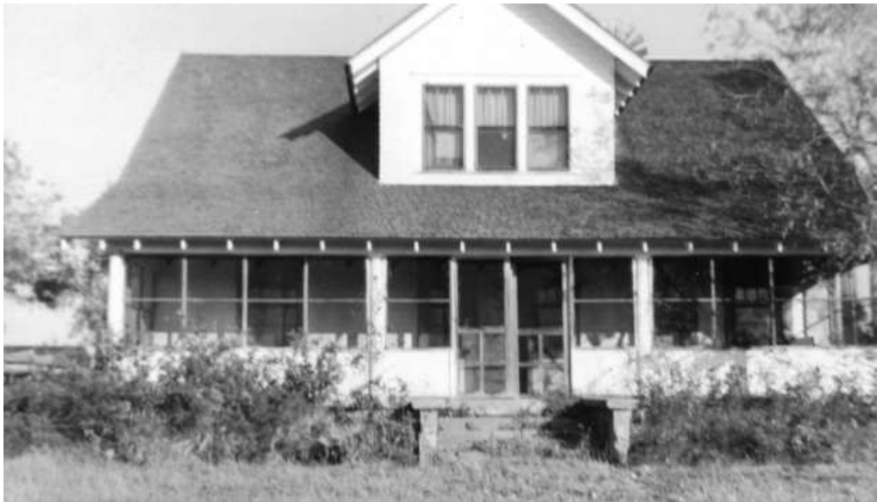
Last Helms home.