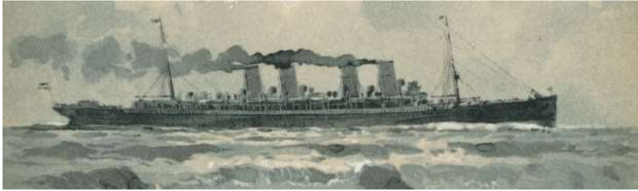
The Kaiser Wilhelm der Grosse.