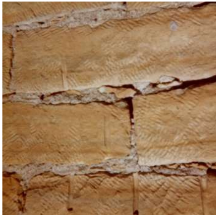
Closeup of limestone rocks used to build the house. Photos by Laurel Busch, 1977.